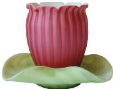
Lot 599 part of lot